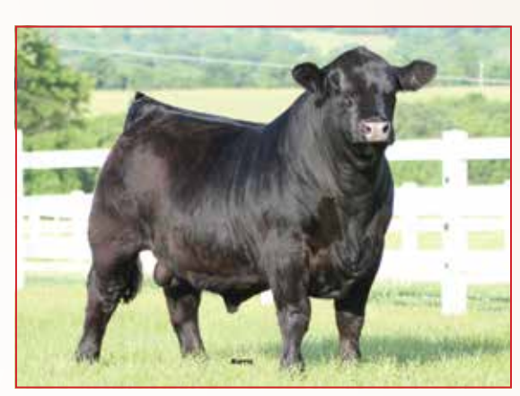
FWLY LHC CAPITAL ET • Sire of Lot 3A