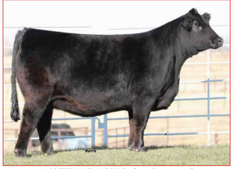
MAGS ETERNAL FLAME 580E • Dam of Lots 36A & 36B

Form and function are built into this FWLY LHC Capital son out of the proven donor MAGS Eternal Flame. ATAK Knuckle is a double homozygous 71% Lim-Flex. We appreciate this bull for his length and muscle shape, and his impressive numerical profile. Make sure to circle him in your catalog and look him up sale day!