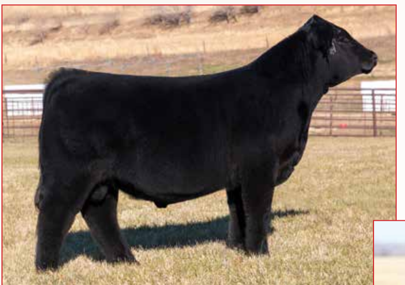
KLS SULL CHARMER ET • Sire of Lot 2