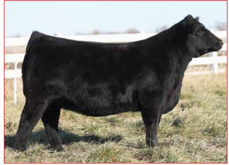
CELL JAZZY 1572J • Dam of Lot 3

The sire of this mating is TASF Heineken 405H ET, the top-selling $44,500 lot in the 2021 Thomas & Son Farms New Year's Resolution Online Bull Sale. He is a double homozygous son of TASF Crown Royal 960C and out of Pleasant Valley Elsa 1439. TASF Crown Royal 960C is the highly renowned son of DHVO Deuce 132R and TASF Whiskey Lullaby 357W. TASF Heineken 405H ET's dam is a daughter of EXAR Classen 1422B. From a phenotypic standpoint he is big footed, relaxed in his pasterns and excellent when you set him in motion. Numerically, he ranks in the top half of the breed or better in some of the most relevant traits in the industry today—weaning weight, yearling weight, carcass weight, ribeye, marbling and mainstream terminal index.