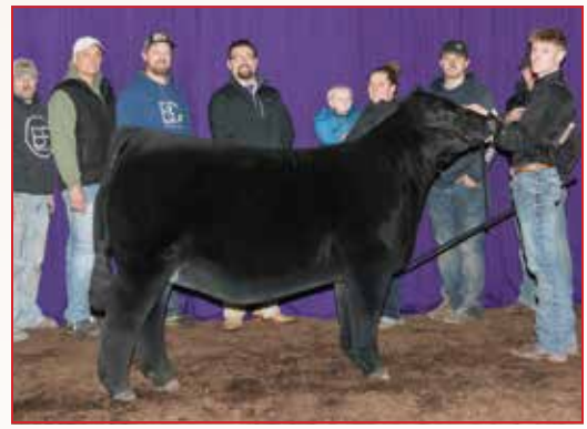
Full sib to Lot 2