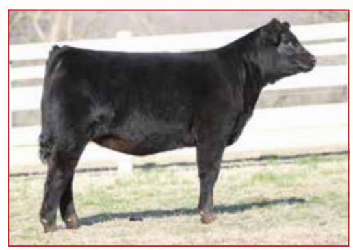
MINO KALAMITY JANE 052K • Daughter of Lot 1