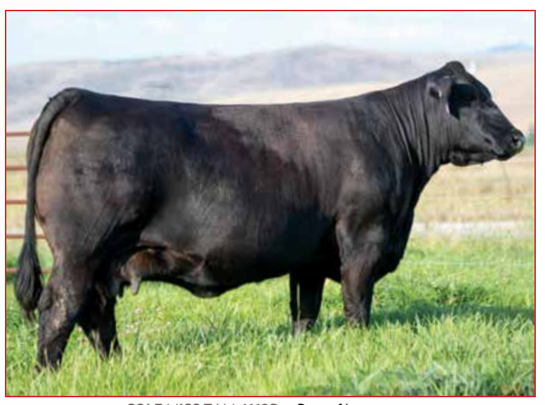
COLE MISS ZAM 6112D • Dam of Lots 16 & 17

Here is a tremendous quality female with cow power and massive overall dimension. She is robust through her center body, unbelievably strong in her top, and flat out good from all angles. They don't make them like this every day. She is sired by CJSL Creed 5042C, the proven MAGS Aviator son. This female deserves some serious attention.