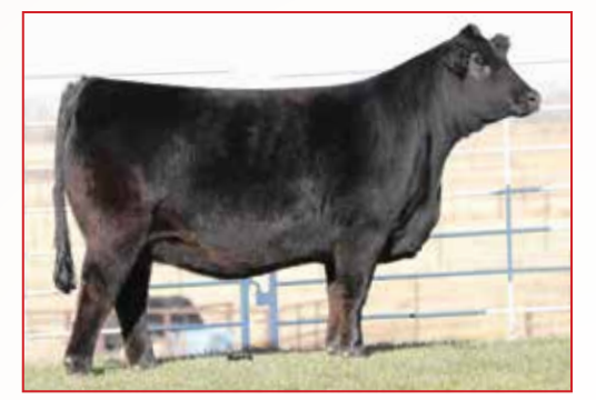
AUTO CHAPERALL 406C ET