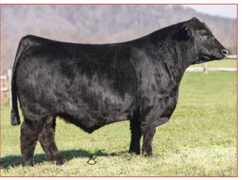
CJSL CREED 5042C • Sire of Lots 16, 17 & 19