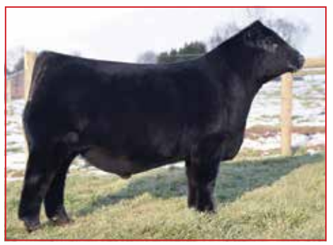
TASF HEINEKEN 405H • Service sire to Lot 27