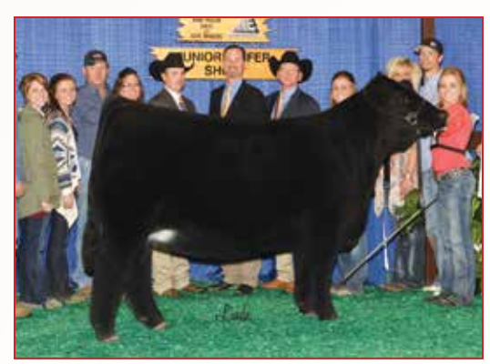
RIVERSTONE CHARMED • Paternal grandam to Lot 2