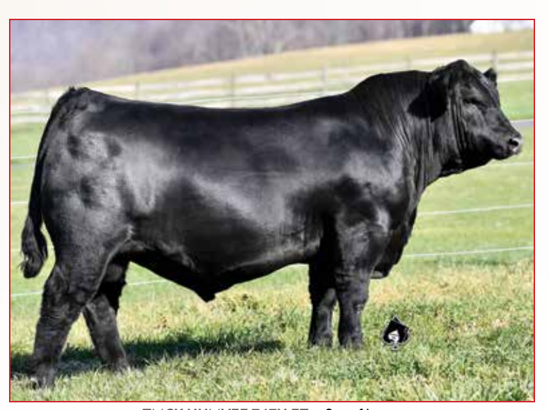
TMCK HUMVEE 767H ET • Sire of Lot 21

Check out this young miss. ATAK Kaia is an exciting 50% Lim-Flex. With her pedigree, you know you'll have years of exciting producing ability. Plus, she offers a functional set of numbers. This sound-moving female is straight in her top with a square hip design and smooth shoulder. She sells bred to MAGS Hedge Fund, the 50% Lim-Flex son of MAGS Federal Reserve x MAGS Andrea. He is double homozygous with a top 20% for Milk and top 10% for Marbling.