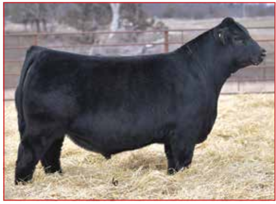
CELL KILIMANJARO 2218K ET • Sire of Lot 4B

CELL 7215E ET hails from two of the most impressive individuals in the Limousin breed. Her sire, AHCC Cowboy Kind C595, is a known producer of powerful herd sires and deep, broody daughters. Her dam, EF Xpect The Best, has captured many hearts as she continues to produce progeny that have continuously found their way to the winners circle. The blending of these greats has created the stunning female. She is a beautifully designed 62% Lim-Flex that is homozygous polled. Her pedigree is solid from top to bottom providing exciting opportunities that meshes nicely with her well-balanced numerical profile.