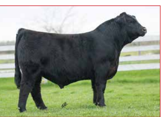
FWLY LHC CAPITAL ET