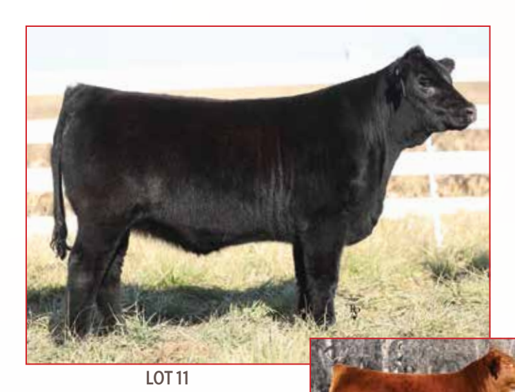
ROYAL JESTER RBGL 103J • Sire of Lot 11