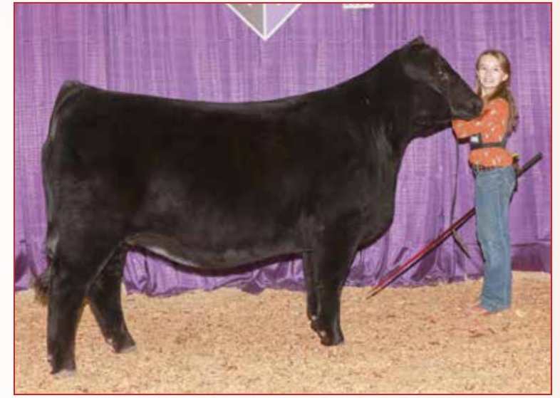
SEEE KRIS' PINA COLADA ET • Dam of Lots 5A & 5B

The sire of this mating is TASF Heineken 405H ET, the top-selling $44,500 lot in the 2021 Thomas & Son Farms New Year's Resolution Online Bull Sale. He is a double homozygous son of TASF Crown Royal 960C and out of Pleasant Valley Elsa 1439. TASF Crown Royal 960C is the highly renowned son of DHVO Deuce 132R and TASF Whiskey Lullaby 357W. TASF Heineken 405H ET's dam is a daughter of EXAR Classen 1422B. From a phenotypic standpoint he is big footed, relaxed in his pasterns and excellent when you set him in motion. Numerically, he ranks in the top half of the breed or better in some of the most relevant traits in the industry today—weaning weight, yearling weight, carcass weight, ribeye, marbling and mainstream terminal index.