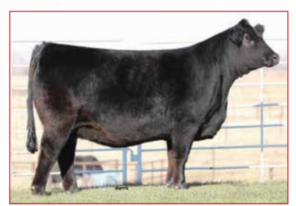
MAGS ETERNAL FLAME 580E