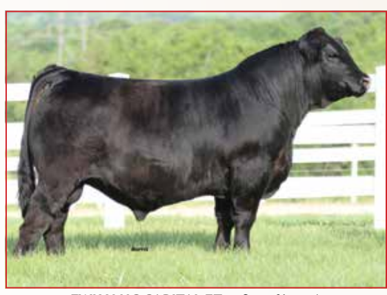
FWLY LHC CAPITAL ET • Sire of Lot 5A