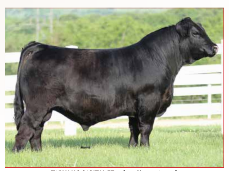
FWLY LHC CAPITAL ET • Sire of Lots 36A & 36B