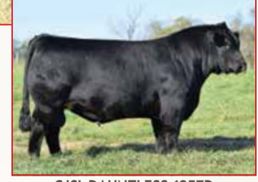
CJSL DAUNTLESS 6257D Service sire to Lot 18