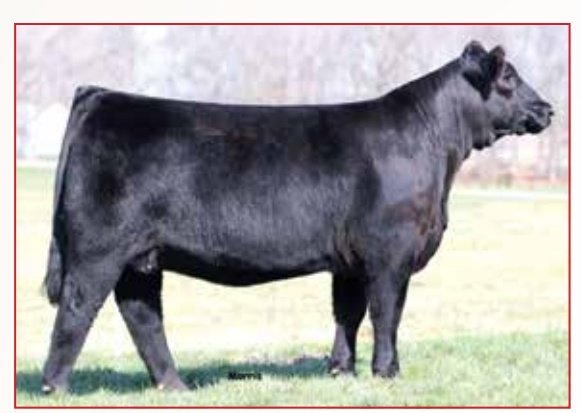
AUTO POPPY 421Z