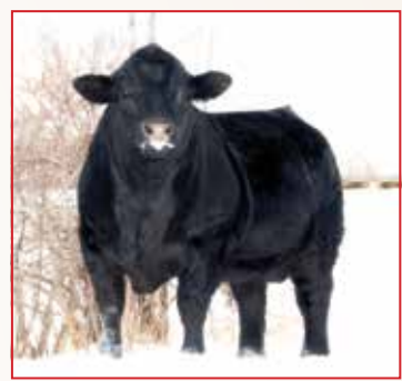
TMCK DURHAM WHEAT 6030X Sire of Lot 28