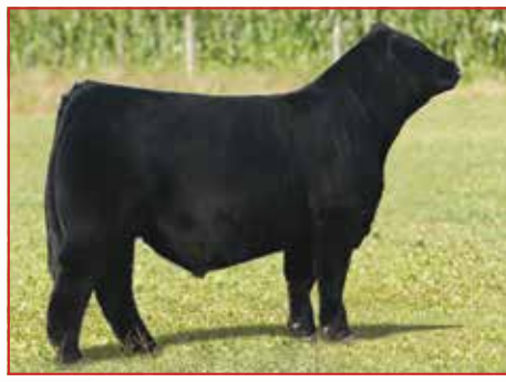
SSTO GUNS N ROSES 9408G • Service sire to Lot 26