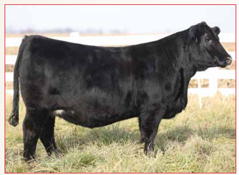
ATAK KARMA • Maternal sib to Lots 4A & 4B