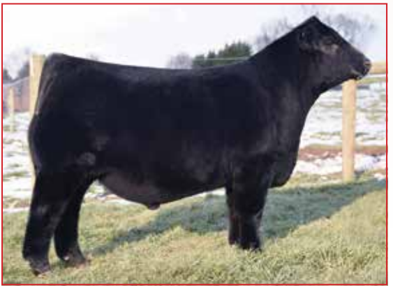
TASF HEINEKEN 405H • Sire of Lot 5B