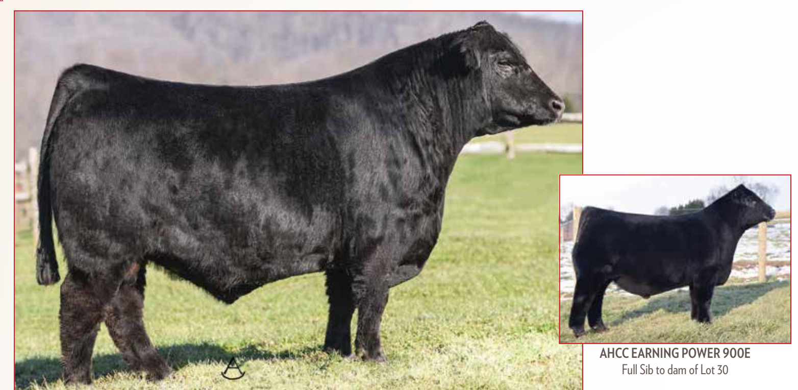
CJSL CREED 5042C • Sire of Lot 31