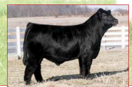
FWLY CAN DO • Maternal sib to Lot 1

1A: $1500 for 25 units 1B: $1000 for 15 units