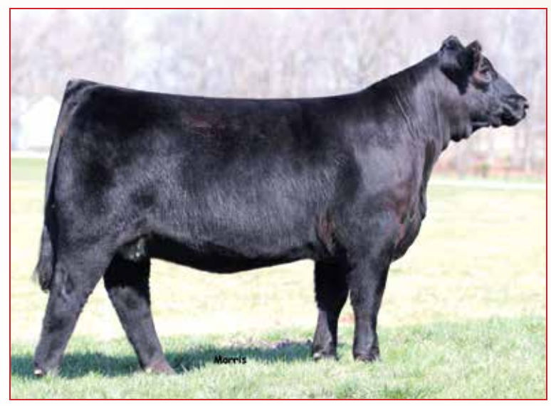
AUTO POPPY 421Z • Maternal grandam of Lot 24

ATAK Koil is a homozygous polled, 53% Lim-Flex female that offers length of body, massive rib shape and a wide top. She has an elegant head and neck and is sure to have attractive progeny. She's the kind we strive to make, and we are excited to see what she will do in someone else's herd. She sells bred to MAGS Hedge Fund, the 50% Lim-Flex son of MAGS Federal Reserve x MAGS Andrea. He is double homozygous with a top 20% for Milk and top 10% for Marbling.