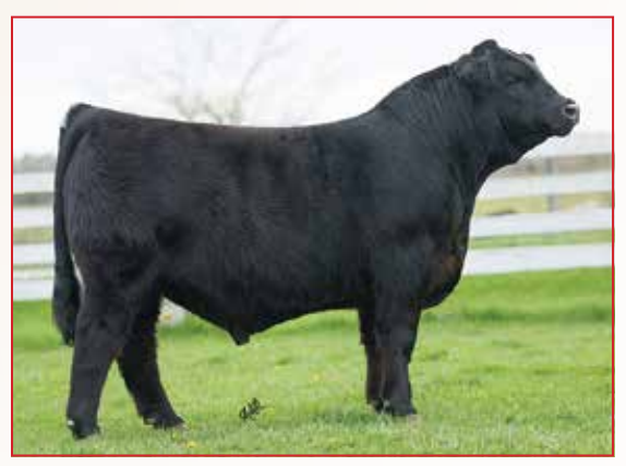
FWLY LHC CAPITAL ET • Sire of Lot 54