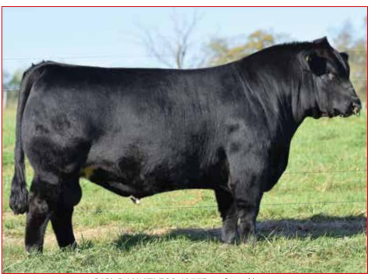
CJSL DAUNTLESS 6257D • Sire of Lot 15