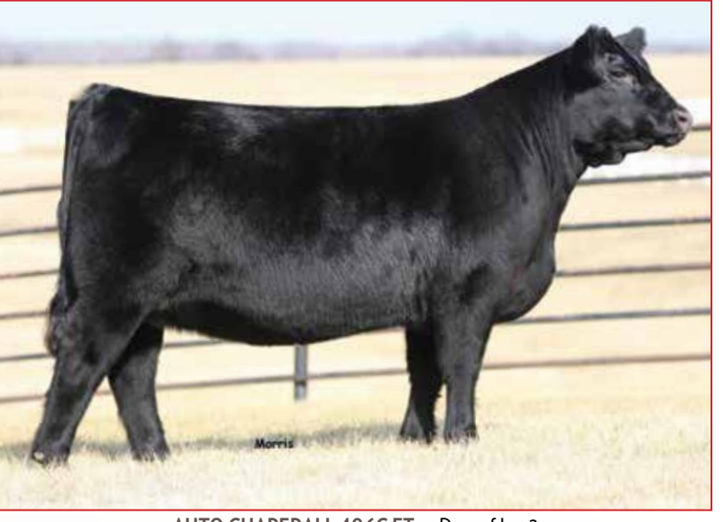
AUTO CHAPERALL 406C ET • Dam of Lot 2