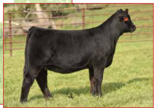
CELL LEXI 3110L • Daughter of Lot 1